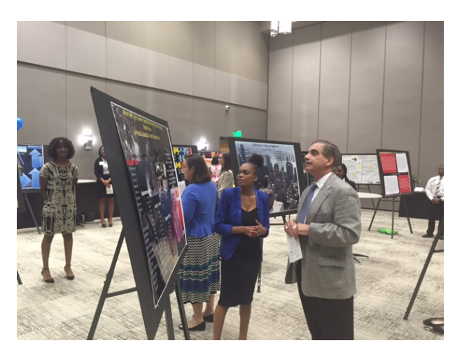
A student presents her career roadmap poster