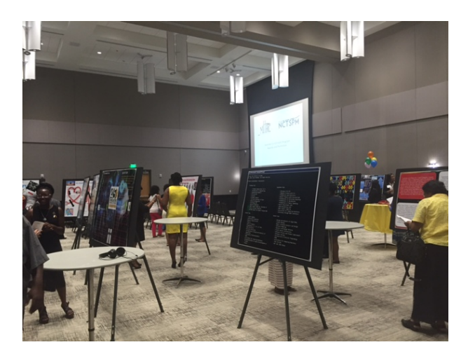
SEP Awards and Promotion Ceremony